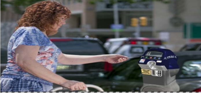
MCD FY 2015 Goals and Accomplishments